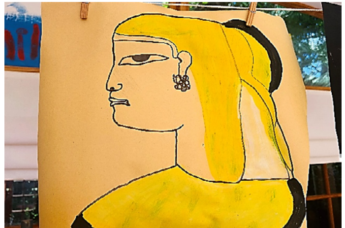
One-dimensional profile - Perspective from Egyptology.

For information on how to enroll, send a WhatsApp text to Ronél Henning +27 (0)82 561 8842 or visit our website https://ladybirdarts.com