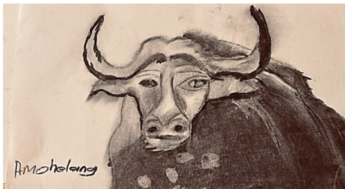
A visual explanation by a student of his perspective of William Kentridge's style.